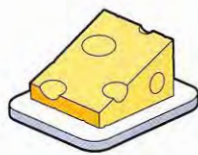
a piece of cheese U