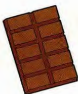
a bar of chocolate U